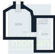
Basement Building 1