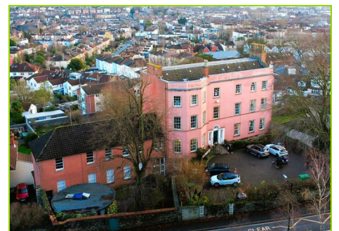
Redland Hill House, Redland Hill, Redland, Bristol, BS6 6UX